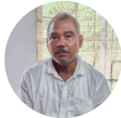
Padmashree Jadav Payeng Forest Man of India